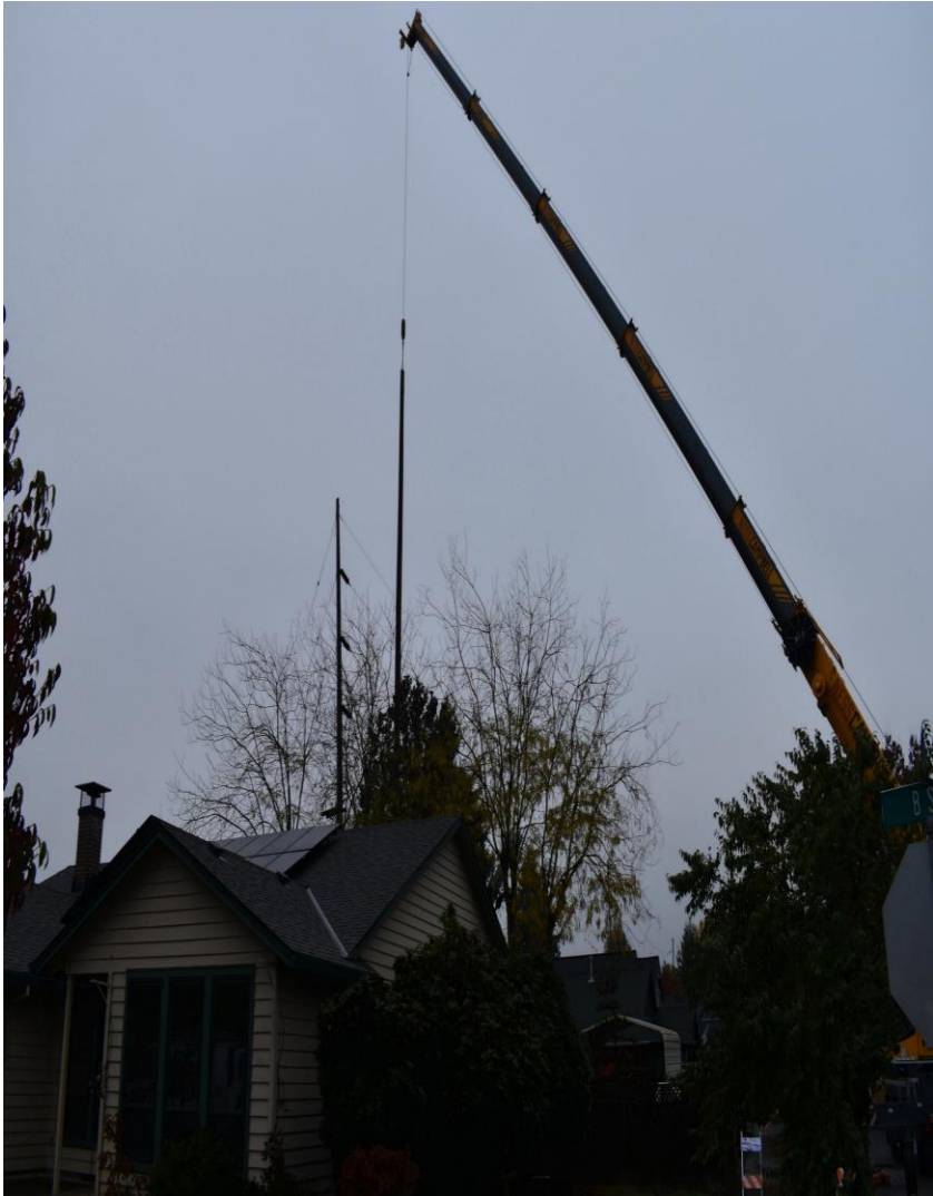
Pre-1970 Pole Replacement Capital Project