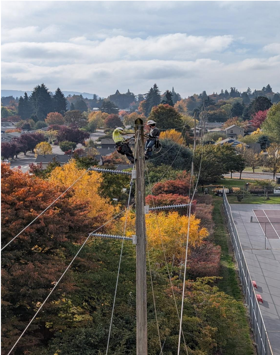
Pre-1970 Pole Replacement Capital Project